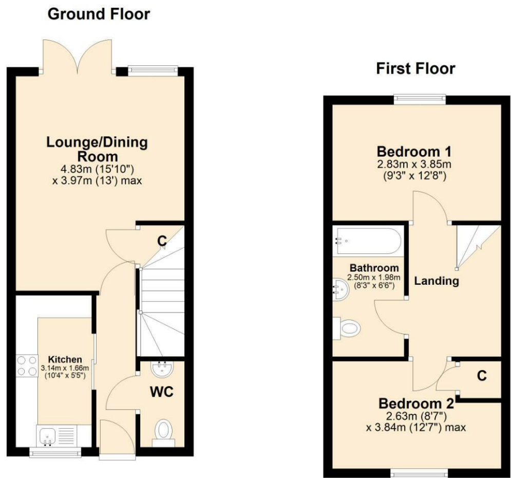
Harford Way, Landkey